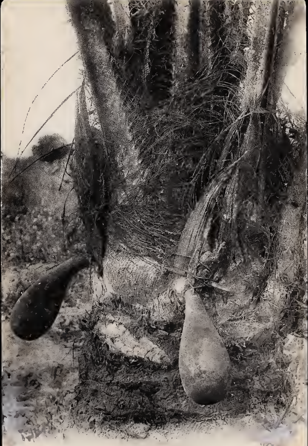
Procédé loango pour recueillir le vin de Palme - Congo Français